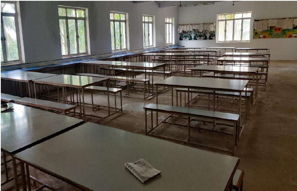
BOYS COMMON ROOM